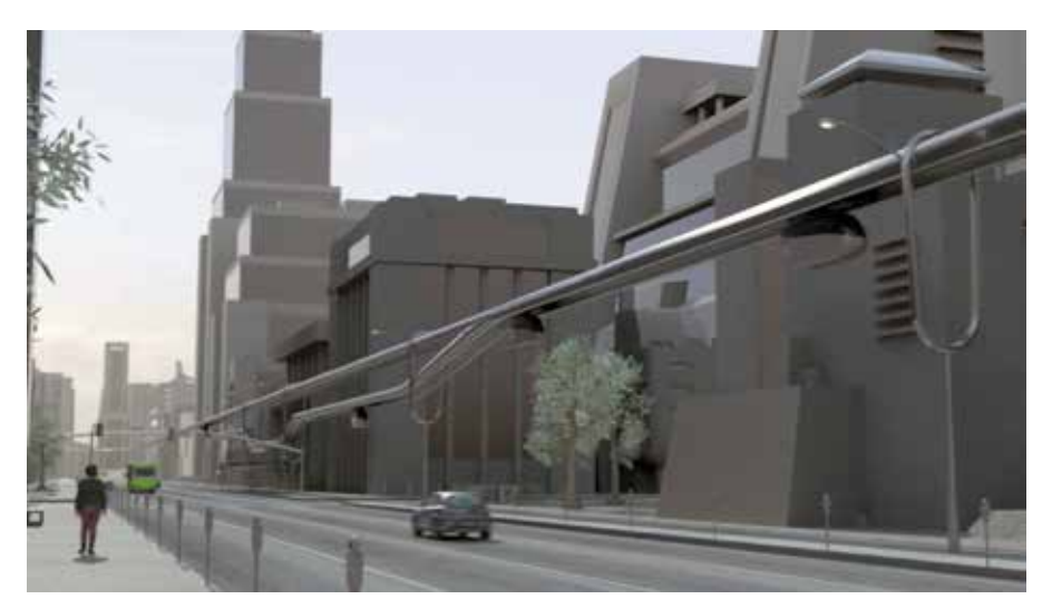
Screen-capture of a video depicting how skyTran might look. View the video at goo.gl/rjqmHF.

The People Mover cost $24.2 million to operate in 2016 but brought in just $1.4 million in fare revenue according to Detroit's most recent annual financial report. Grants and contributions from other sources filled $14.9 million of the