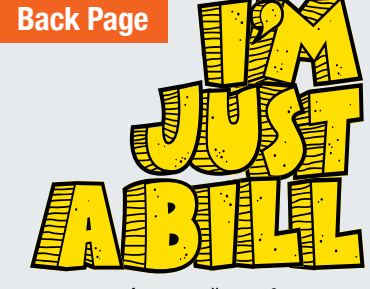
A sampling of proposed state laws