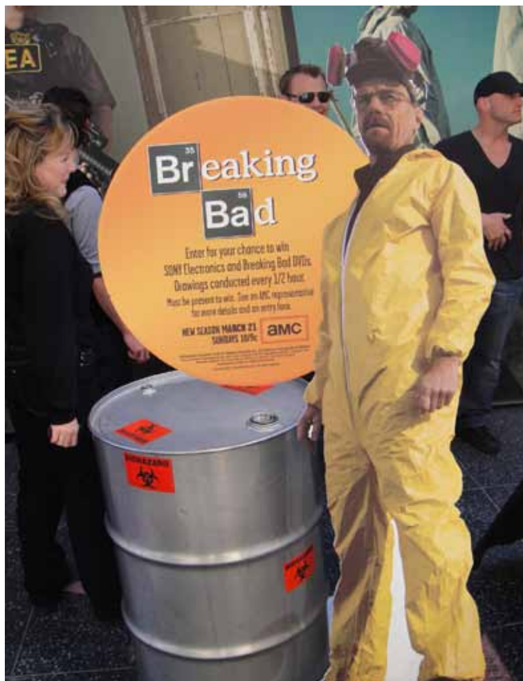
'Walter White,' the drug-dealing chemistry teacher from AMC's hit TV series "Breaking Bad."